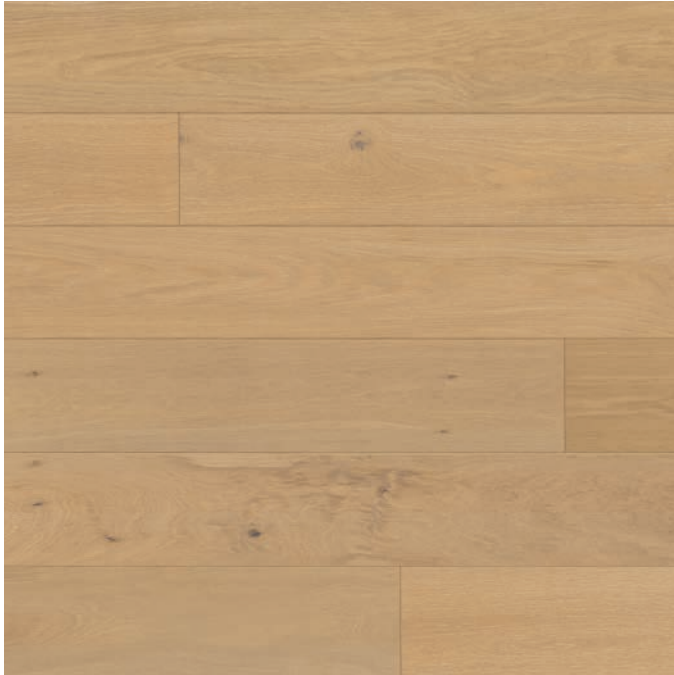
Chambord 100001244 - 7 1/2"x87 1/2" 9/16" Engineered Hardwood