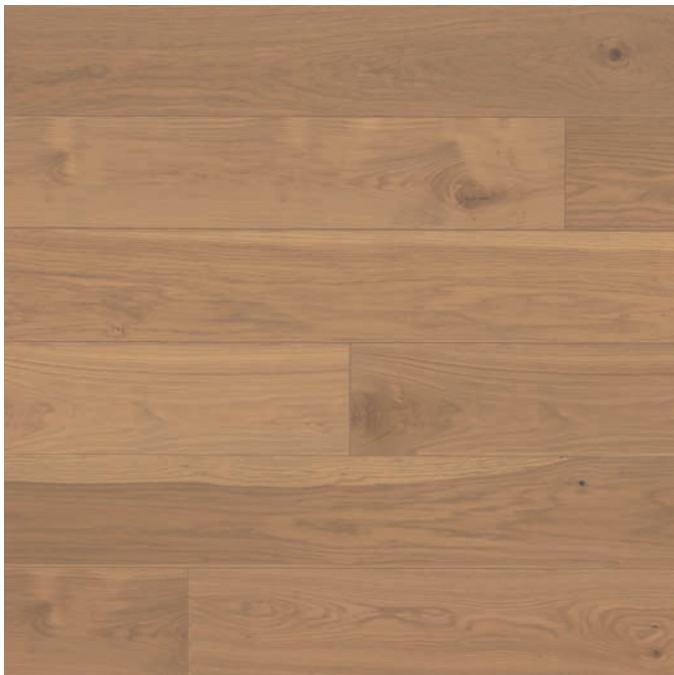
Margaux 100001245 - 7 1/2"x87 1/2" 9/16" Engineered Hardwood