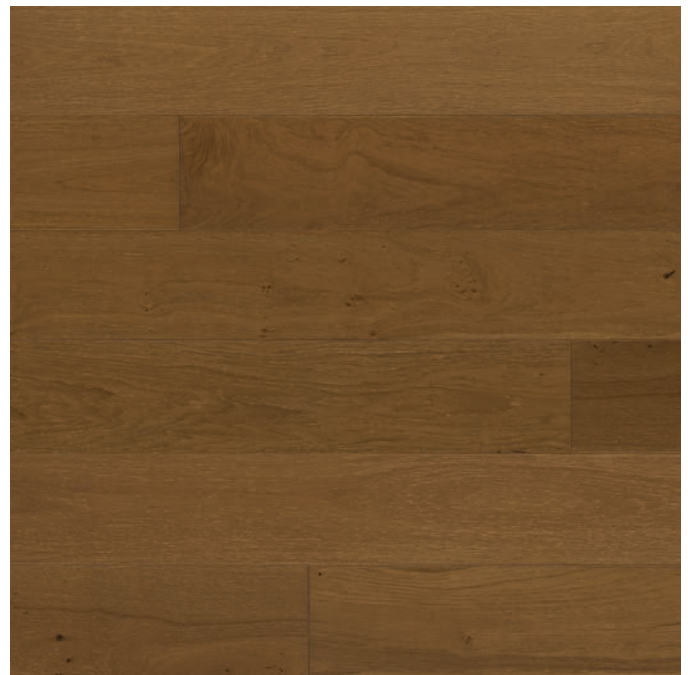
Brissac 100001246 - 7 1/2"x87 1/2" 9/16" Engineered Hardwood