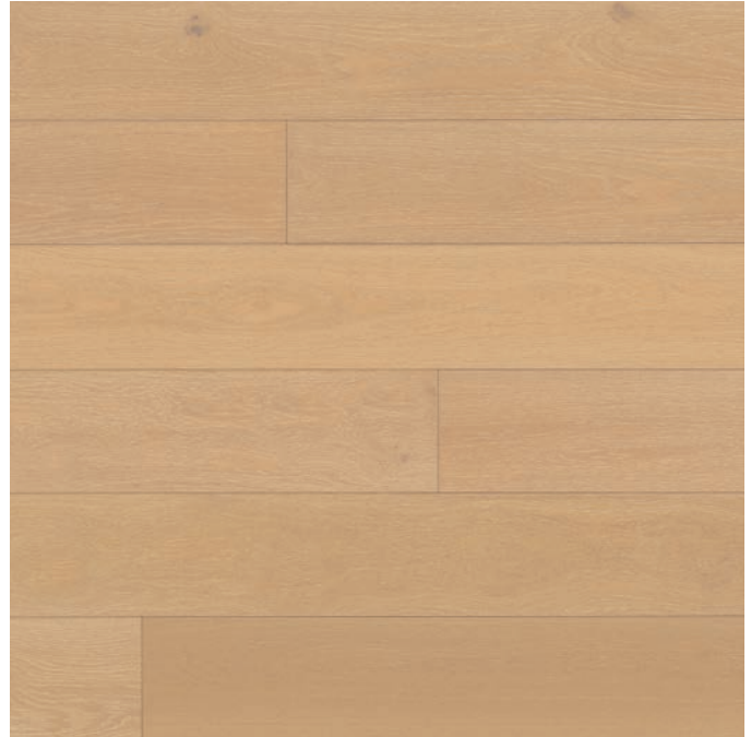
Tanlay 100001243 - 7 1/2"x87 1/2" 9/16" Engineered Hardwood