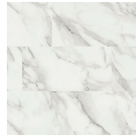
Calacatta Venosa Gold™