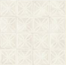
7 7/8" x 7 7/8" Struttura Gelosia 3D (Available in Avorio, Biscotto, Cotto, Grigio) ± 10 mm