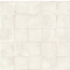
7 7/8" x 7 7/8" Avorio ± 10 mm Number of different graphic design: 26

The inspiration material is hand-made terracotta, with very clearly defined edges and a slightly mottled surface. These distinctive features of traditional ceramics are interpreted with state-of-the-art production technologies to create a versatile series with a decorative spirit, a homage to Sicily and the know-how of its skilled craftsmen. The color assortment, which includes earthy shades – Cotto and Biscotto – and more neutral tones – Avorio and Grigio – presented on a natural surface for the terracotta effect.