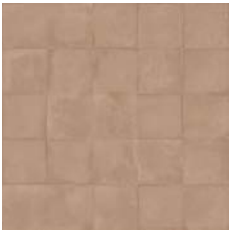
7 7/8" x 7 7/8" Cotto ± 10 mm Number of different graphic design: 32