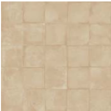
7 7/8" x 7 7/8" Biscotto ± 10 mm Number of different graphic design: 32