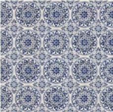
7 7/8" x 7 7/8" Decoro Pizzo (Available in Avorio, Biscotto, Cotto, Grigio) ± 10 mm