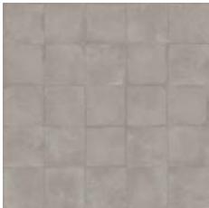
7 7/8" x 7 7/8" Grigio ± 10 mm